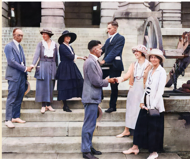
Tennessee Suffragists After the Vote at the Capitol

Their words, their melodies, their courage echo through every note.